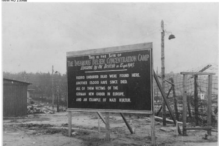
A sign posted by the British army at the entrance to the Bergen-Belsen concentration camp, May 1945