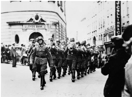
German military band marching past Lloyds Bank on The Poller, St Peter Port, Guernsey, c.1940-1945

The Learning Centre will address the history of subsequent genocides, presenting difficult questions about why the lessons of the Holocaust appear not to have been learned.