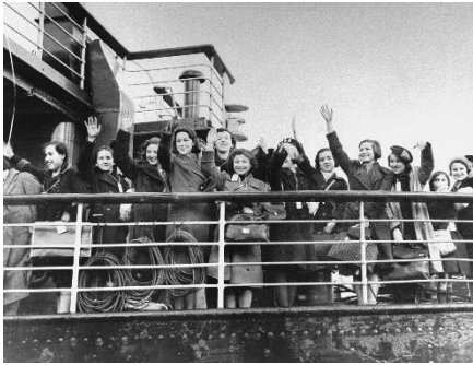
Jewish refugee children, who are members of the first Kindertransport from Germany, arrive in Harwich, 2 Dec 1938

Within the Learning Centre, a powerful audio-visual exhibition will set out the events of the Holocaust from unique British perspectives. The exhibition, which is being developed with input from leading academics, will aim to give an honest account of how British people and the British Government responded to the growth of antisemitism, the demands of Europe's Jews for refuge, and the reality of persecution.